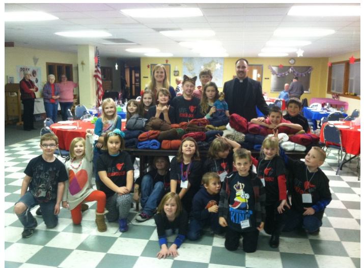
LOGOS KIDS WRAPPING